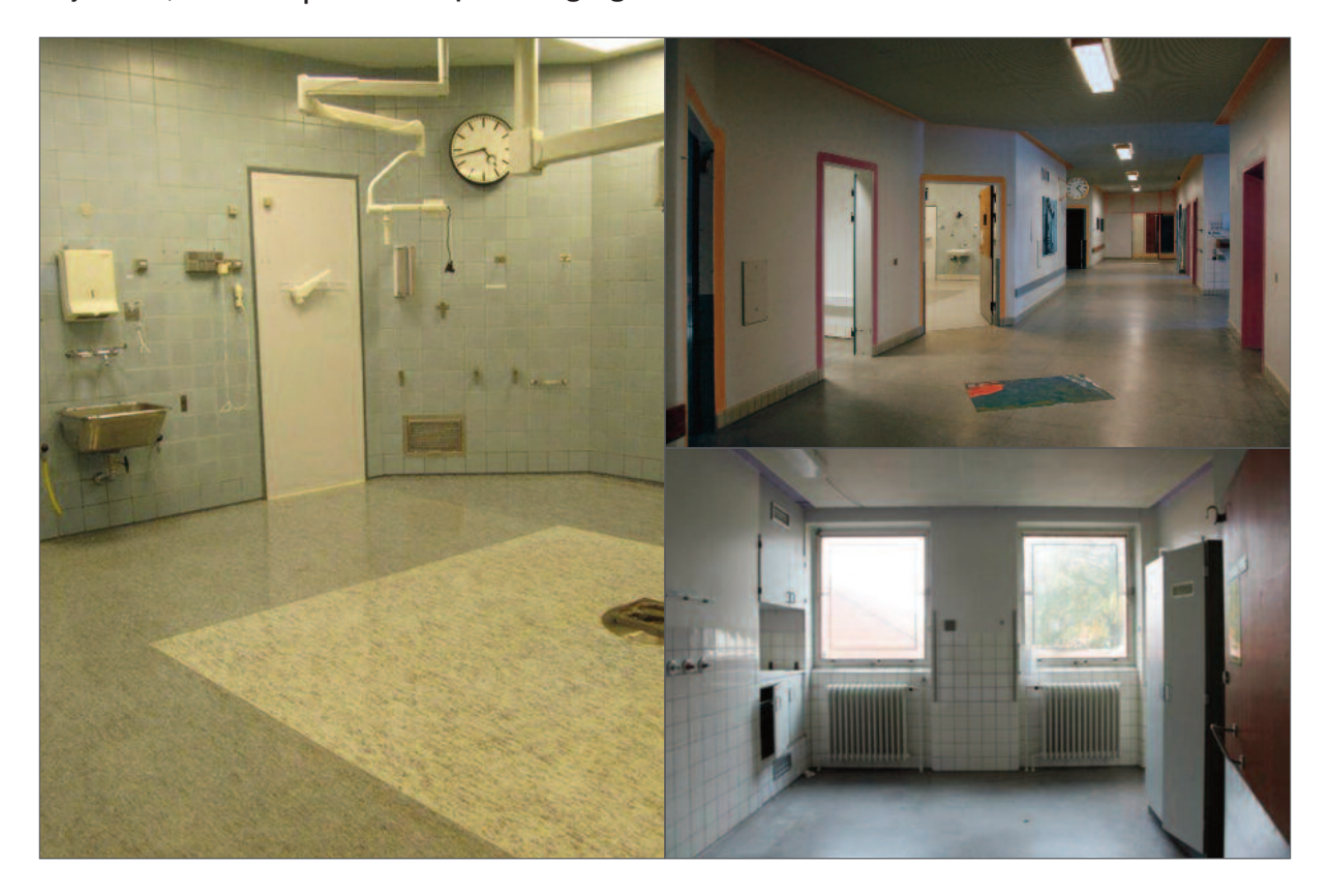
City: Odder, Denmark | Location: Operationsgangen | Floorplan

City: Odder, Denmark | Location: Operationsgangen