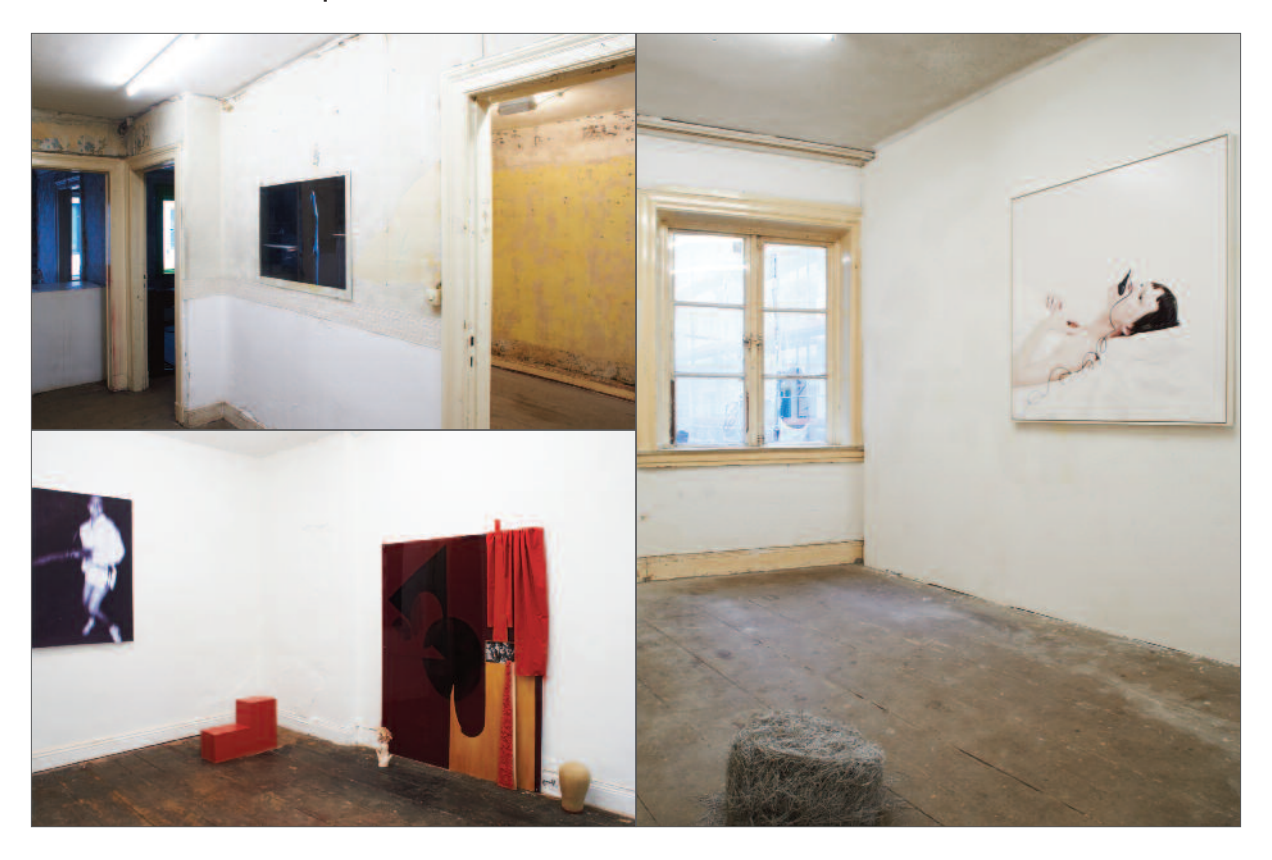
City: Hamburg, Germany | Location: MOM Artspace

City: Hamburg, Germany | Location: Galerie Speckstrasse