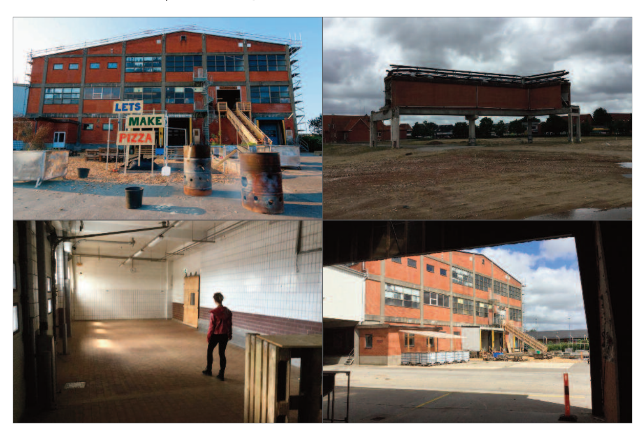
City: Hamburg, Germany | Location: Westwerk

City: Holstebro, Denmark | Location: Slagteriet