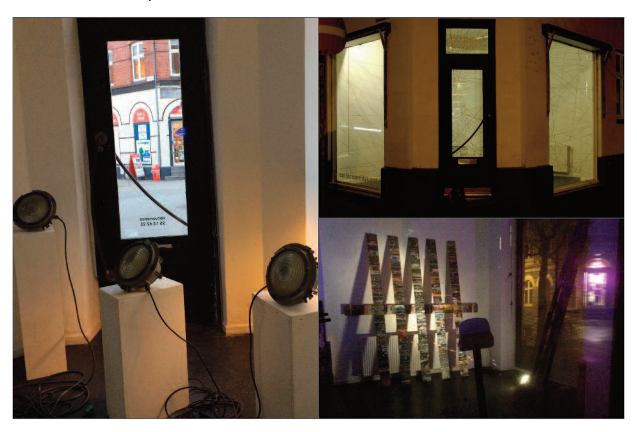
City: Aarhus, Denmark | Location: Århus Kunstakademi – The Project room.